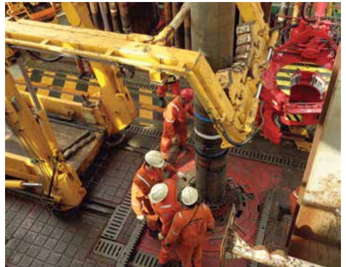
▲ BlueDock™ connectors provide easy, deep and safe stabbing.

During the operation, Petrobras requested to carry out some make-ups using only belt tongs. They were performed successfully, reaching the specified external gap.